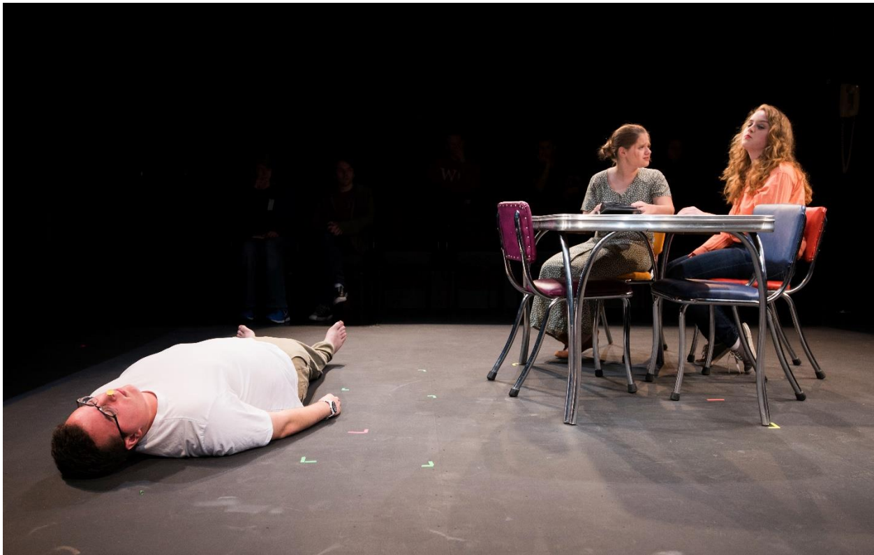
Jerry remains on stage while the next scenes happen without the characters noticing him there.