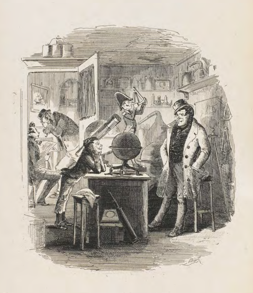
A Visitor of distinction.