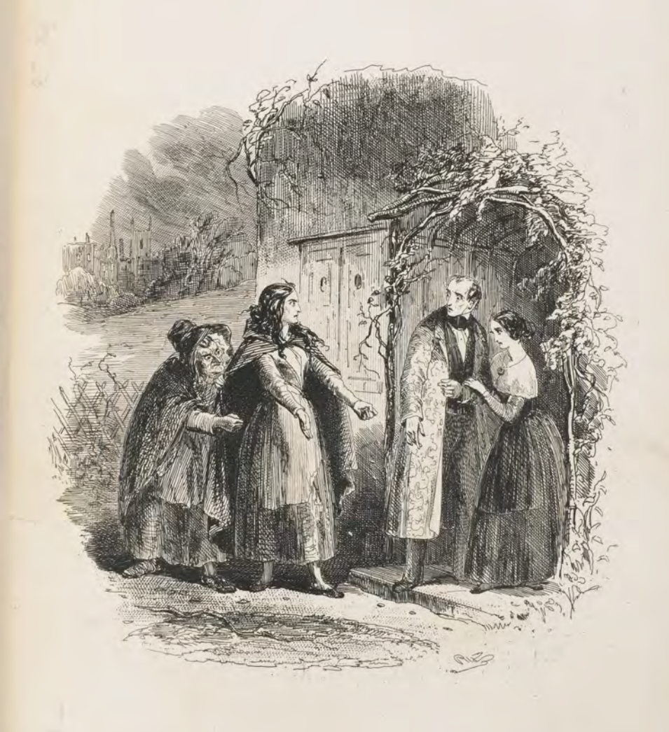
The rejected alms.