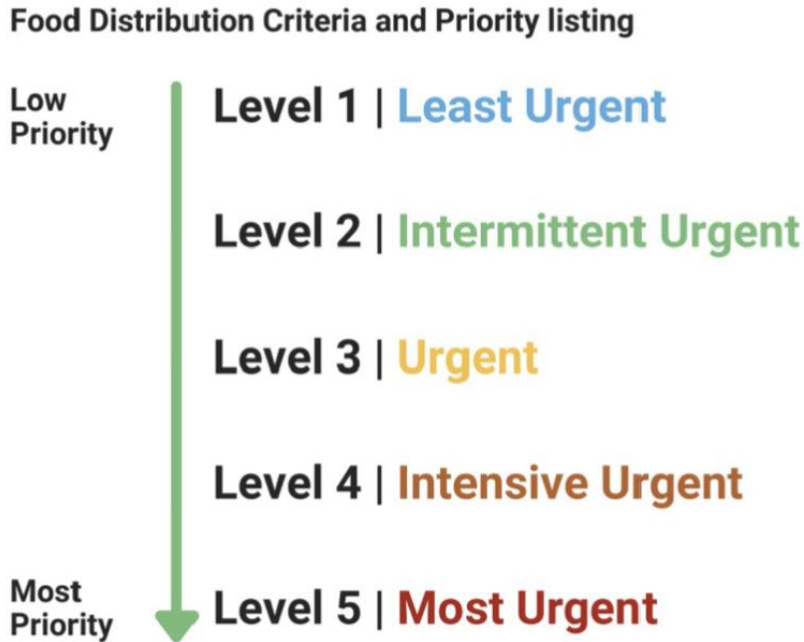
Figure 3: Urgency Indicator Index implemented by SoS Thailand to monitor the urgency of its beneficiaries ( SOS Thailand | Scholars of Sustenance, n.d. ).