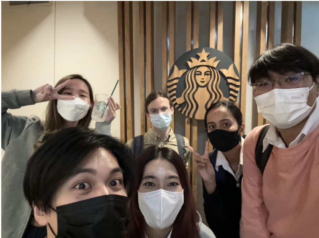
Figure 5: The team at the Starbucks office for interviewing.

The literature review mentioned earlier allowed us to understand the value of government support and policies in expanding food bank operations. Therefore, our interview focused on understanding donors' perception of the importance of a national food bank policy and whether they feel government support is essential. See Appendix B, section B.1 for details on the interview questions we asked the existing donors.