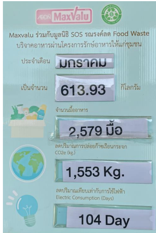
Figure 7: Monthly dashboard regarding food donations outside the MaxValu Laksi branch.

Finally, all three corporations confirmed their partnership with the SoS Foundation helped them manage their excess food. The reports can make them reflect on their consumption forecast system and adjust them to produce lower surplus food overall. Table 1 shows some of the quotes from the interviews of representatives of three existing donors as evidence for SoS’s efficacy, transparency, and benefiting relationship.