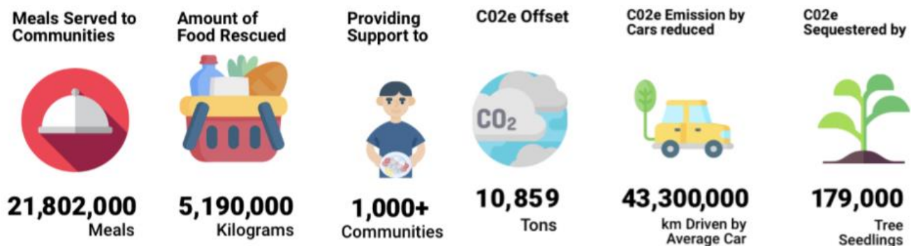
Figure 1: The food rescue and equivalent environmental impact of the SoS Foundation in Thailand since 2016, Last updated January 2023 ( SOS Thailand | Scholars of Sustenance, n.d. ).

Since its inception, SoS Foundation has had success with receiving approximately 20 kg of donated food per day, resulting in enormous positive effects regarding food rescue and environmental impact ( SOS Thailand | Scholars of Sustenance, n.d. ). Since 2016, SoS’s projects have delivered approximately 21.8 million meals to more than 1,000 communities, saved almost 5.2 million kg of excess food, and cut emissions by 10,859 tons of CO 2 . Figure 1 shows a summary of SoS’s impacts since 2016.