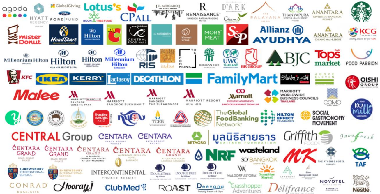
Figure 4: Some of SoS Foundation’s current partners in Thailand ( SOS Thailand | Scholars of Sustenance, n.d. ).

The primary driving force for food-related businesses to donate food is being overstocked with food and having no storage to store the surplus food. SoS Foundation also takes the liability to be held accountable if any food from the food donors causes illness among the food recipients, reducing the hesitancy food businesses might have when donating their excess food.