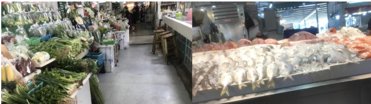
Figure 8: Views of the individual stores in the Sam Yan Market.

Another example of a decentralized system is fresh markets. Currently, Sam Yan Market lacks employees and stated that the shop owners are likely to participate in food donation if a system makes it easier for them to donate. The interviewee said that if there were a system that could collect food donations, the participation rate among store owners would increase. The statement implies that there have been previous problems with shops putting too much labor or cost into donating surplus food. Because she has expressed interest in assisting the local stores with donations that simultaneously could help with motivation, she wants to develop a centralized system throughout the market that could be administered with the help of the SoS Foundation.