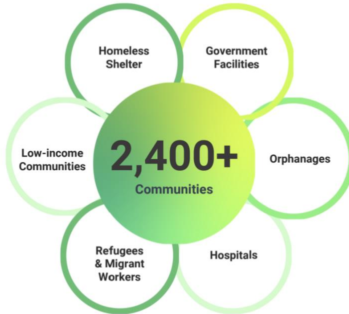
Figure 2: Categories of beneficiaries that the SoS Foundation provides food aid to in countries it operates in ( SOS Thailand | Scholars of Sustenance, n.d. ).

The foundation delivers food aid to its beneficiaries in various ways, for example, by providing packaged ready-to-eat food, ingredients for the vulnerable communities to cook for themselves, or having its volunteers cook for the individuals at the site to distribute food aid.