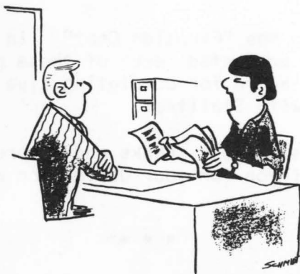
"Here's all the reports you asked for . . . and one on the time it takes me to fill out all the reports you asked for."