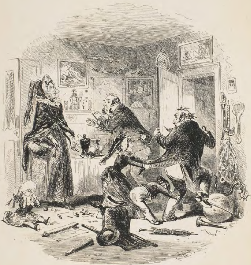
The Midshipman is boarded by the enemy.