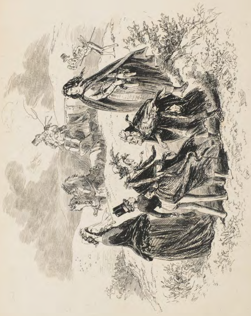
A chance Meeting