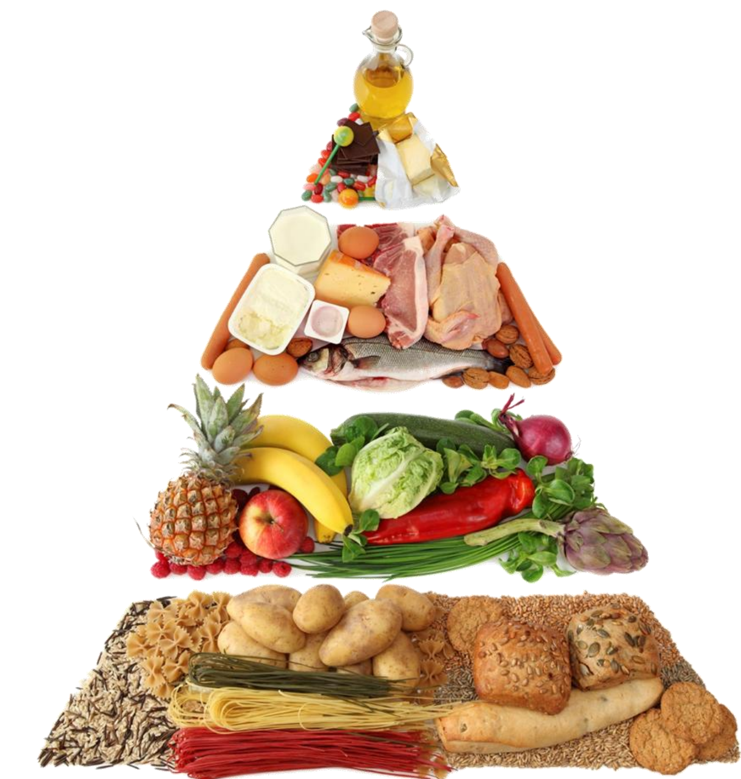
Guide to daily nutritional requirements