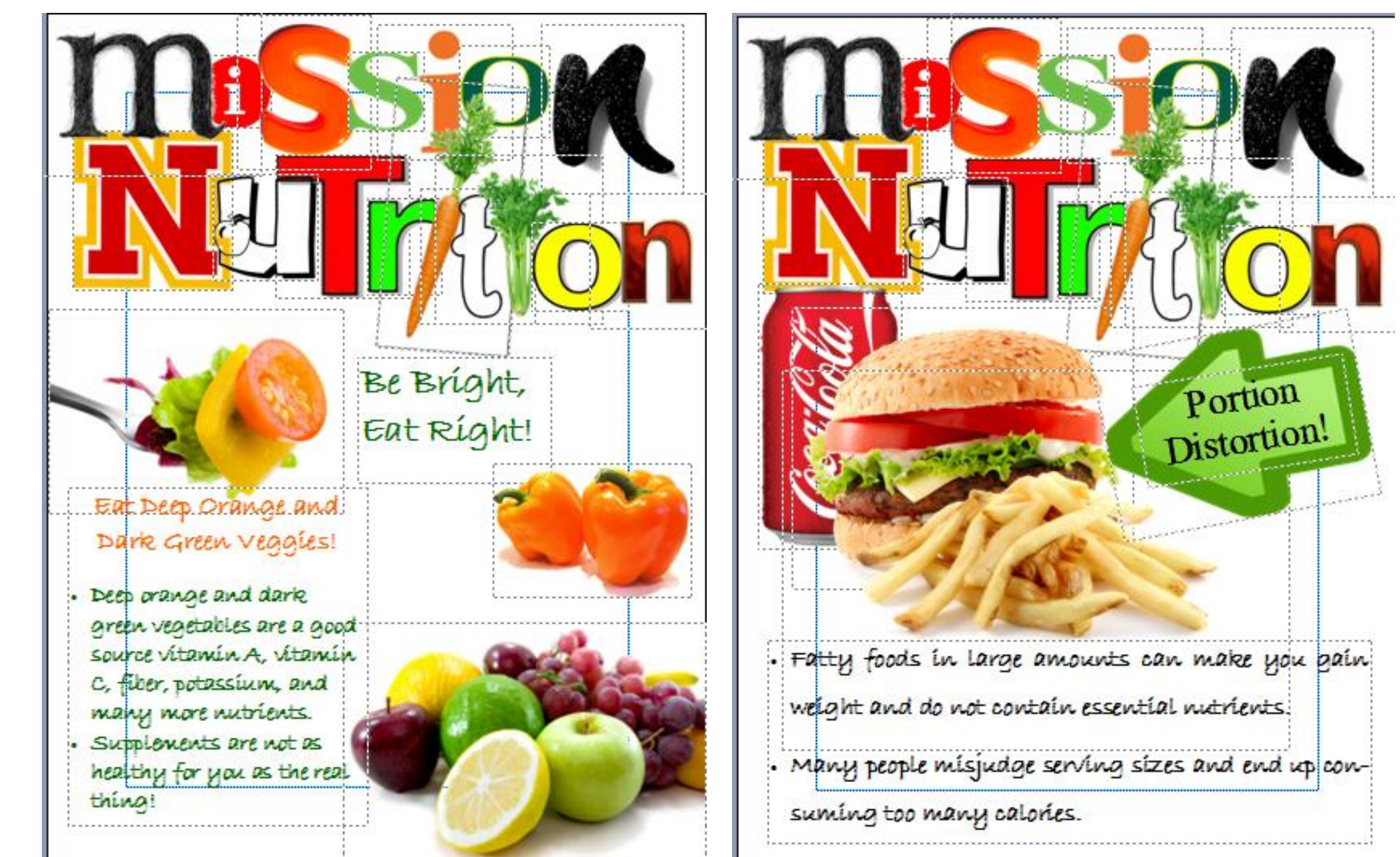
Examples of posters to be displayed around campus