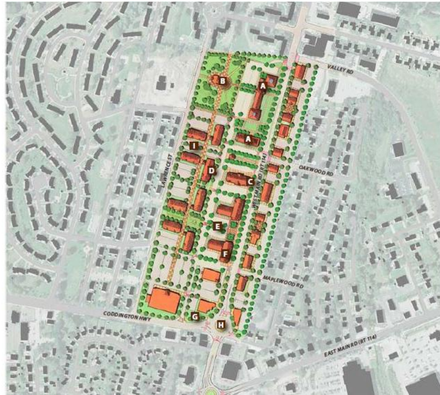
Figure 7 Middletown's proposed plan for downtown area

Utah and Rhode Island’s definitions of zoning allow for many strategies to be taken. This may lead to many different approaches regarding zoning between municipalities but it also keeps many city and town planners content.