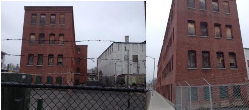
Figure 8: 128 Chandler Street

Due to its large size we believe the building's optimal use would be for a mixed use area. The first floor could be used for a healthy foods market while the top three floors could be renovated into affordable housing. This would cut down on the need for residents in the top three floors to drive to have access to food options. This would ultimately cut down on carbon emissions.