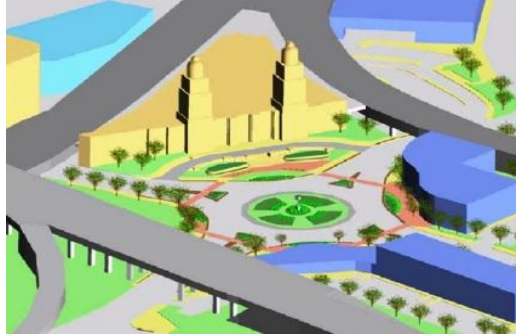
Figure 4 Washington Square Worcester http://www.worcestermass.org/city-initiatives/washington-square-redevelopment

On a more local note, downtown Worcester, Massachusetts, also known as Washington square, is currently remodeling part of their downtown area. The conversion of the former Washington Square rotary into a smaller roundabout has dramatically transformed the area around Union Station by creating four parcels that are significant transit-oriented development opportunities. Washington Square is one of the most important transit nodes in the Commonwealth of Massachusetts, home to Union Station—the western terminus of the Massachusetts Bay Transportation Authority’s commuter rail line—as well as a hub for both inter-and intra-city bus service (City of Worcester). This mixed-use renovation will allow for: more airy space around the downtown city green, better walk-ability amongst those who take public transportation or walk/bike to and from work, and the development of clean, small-scale business such as coffee shops, professional offices, healthy food markets etc. The overall connection between Washington Square and residential neighborhoods also improved (City of Worcester).