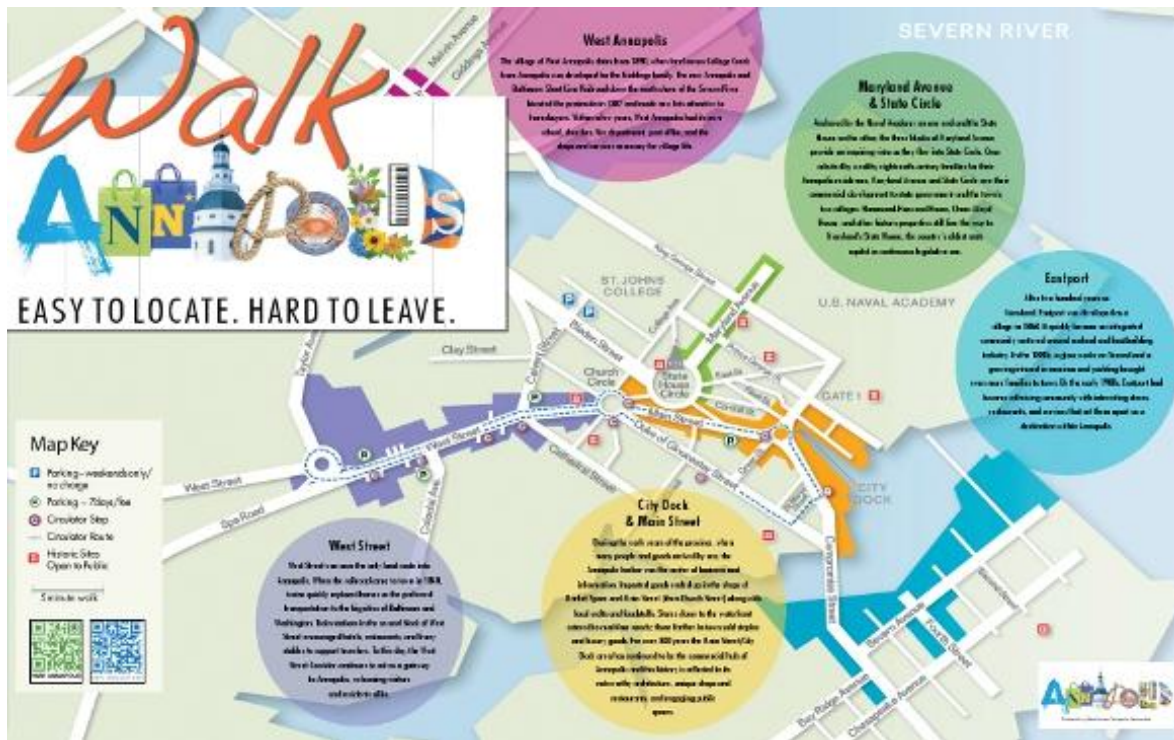
Figure 2 Map of walking routes in Annapolis, MD http://mainstreetsannapolis.org/

Public space plays a large role in the overall walkability of a city. According to Walkable Communities Inc., the most walkable neighborhoods have a usable public space within 1/8 of a mile of housing clusters (Walkable Communities 2013). The city of Savannah, Georgia is a prime example of deliberate land use planning that positioned public space within walking distance of residential neighborhoods. Not only is Savannah’s public spaces something to be sought after, their street organization is claimed to be one of the best in the nation. According to the Philadelphia planner, Edmund Bacon, the Savannah streets are “so exalted that it remains as one of the finest diagrams for city organization and growth in existence” (Erwin 2013). In the figure below Savannah’s public spaces are marked by red circles.