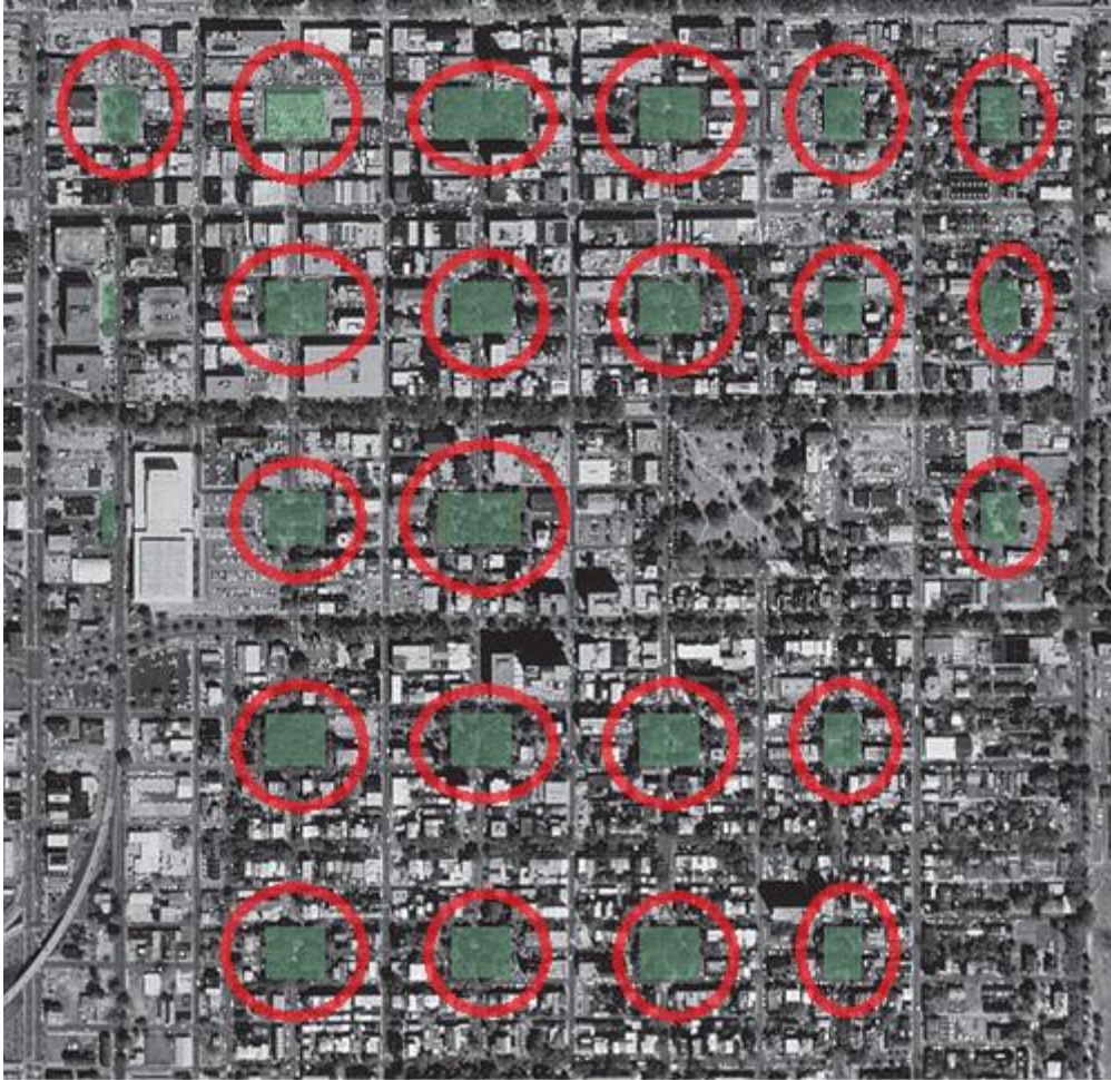
Figure 3 Savannah's Public Space http://en.wikipedia.org/wiki/File:SquaresOfSavannah.jpg

These public spaces are essential to the city's walkability. With an ample amount of public space it allows for residents to become less auto-dependent and promotes walking. It gives residents a place to rest during shopping or allows for residents to rest while on walks.