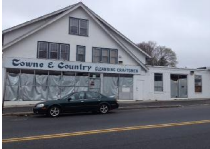
Figure 9 418 Chandler Street

The third and final location we identified is unlike the first two, it is an unused parcel of land. This allows for it to address any issues with the surrounding area. A possible suggestion that we believe could be successful in the area is a possible afterschool program could be constructed on the plot of land. Two plots over is the Worcester Youth Center (WYC), we believe in collaboration with the WYC it would be a great success for children in the area. With the plot of land completely vacant, it allows for a building to be constructed to address the specific needs of the area. The figure located below is the vacant plot, it is about 1600 square feet and located at 326 Chandler St.