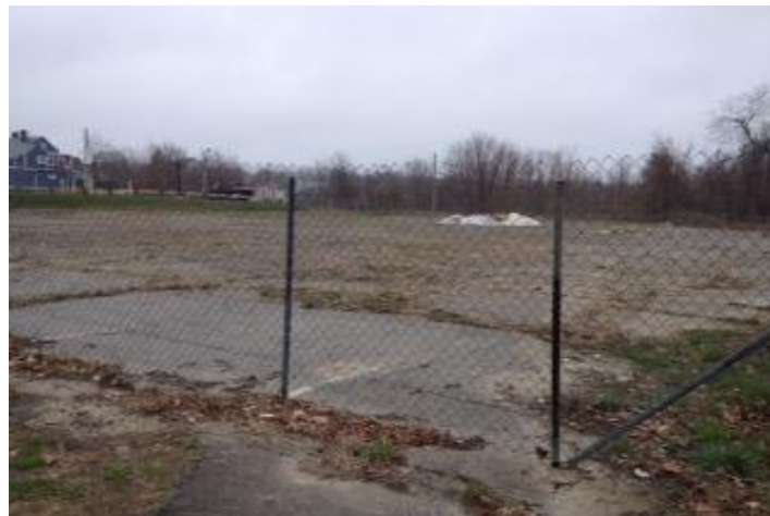
Figure 10 326 Chandler Street

The third and final location we identified is unlike the first two, it is an unused parcel of land. This allows for it to address any issues with the surrounding area. A possible suggestion that we believe could be successful in the area is a possible afterschool program could be constructed on the plot of land. Two plots over is the Worcester Youth Center (WYC), we believe in collaboration with the WYC it would be a great success for children in the area. With the plot of land completely vacant, it allows for a building to be constructed to address the specific needs of the area. The figure located below is the vacant plot, it is about 1600 square feet and located at 326 Chandler St.