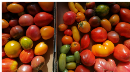
Figure 3. Rognean Orchard farmer profile.