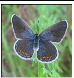
Fig 1. Female Karner blue butterfly

The Karner blue butterfly, Plebejus melissa samuelis , (Fig. 1) is a critically endangered butterfly on the brink of extinction. The Karner blue butterfly, KBB, survival is dependent on the wild lupine plant, Lupinus perennis (Fig.2), which grows in oak savannas and pine barrens and thrives in full sun to partial shade with sandy soils. The butterfly has two broods each year, where they lay eggs on the wild lupine stems and leaves or nearby grasses and sedges. The larvae only consume the leaves of wild lupine, while adults obtain nectar from a variety of plants (Table 1). Since the survival of the KBB is contingent on wild lupine, management and conservation of wild lupine and other nectar sources is critical to maintaining and growing KBB populations.