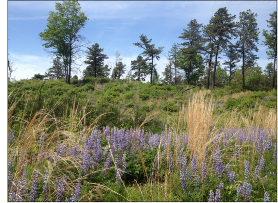
Fig 4. Example of Karner blue butterfly habitat