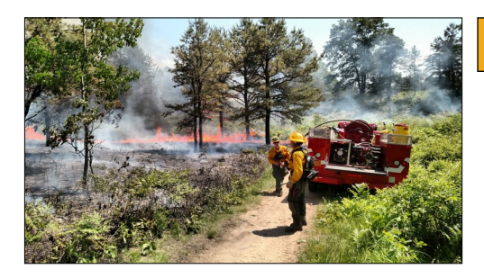
Fig 5. Prescribed burning at Albany Pine Bush Preserve