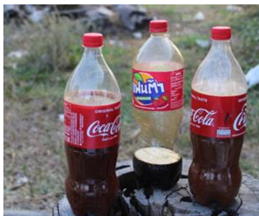
Figure 5. Fermented juices brewed in one-liter bottles in Sakon Nakhon. January 16, 2019