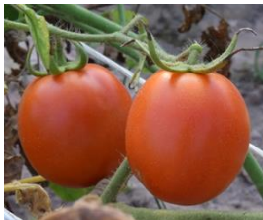
Figure 6. Large, healthy tomatoes grown organically in Sakon Nakhon. January 16, 2019