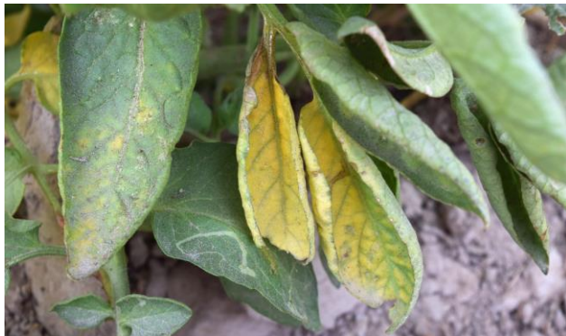
Figure 2. Yellow Wilt Disease in a tomato plant in Sakon Nakhon. January 16, 2019

The fungus is responsible for a disease known as fusarium wilt, or “yellow wilt.” This fungus resides within the soil, and infects tomato plants through its roots and stem. As shown in Figure 2, symptoms of this disease include the gradual wilting of plant’s leaves starting at the lower, older leaves and progressing to the upper, younger leaves, a transformation of leaf color from green to yellow, and the eventual death of the plant cells. The fungus thrives in hot, arid weather when the soil is low in moisture. Similarly to the bacteria causing green wilt, the fungus is often be spread via water, insects, or farming equipment (Wangsomboondee, Teerada, Personal Interview, 2019, Jan 23).