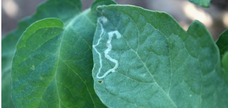
Figure 4. Leaf Miner Damage in tomato plants in Sakon Nakhon. January 16, 2019