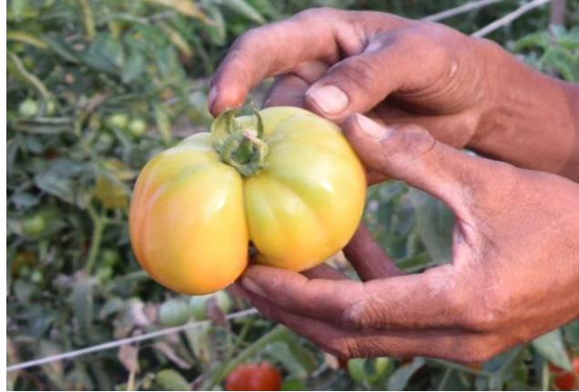
Figure 1. Catfacing defect in tomato in Sakon Nakhon. January 16, 2019