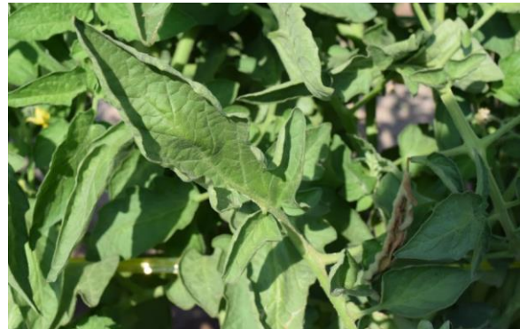
Figure 3. Green Wilt Disease in tomato plants in Sakon Nakhon. January 16, 2019

An abundance of insects that favor tomato plants exists in Thailand. The insect pests that devour tomato plants in northeastern Thailand include, but are not limited to leaf miners, aphids, thrips, whiteflies, and cotton bollworms. Leaf miners are insects that, in their larval state, eat through the surface of leaves until they are ready to advance to later stages in their life cycles. The effects of these larvae devouring the plants are nonlinear white trails in the plant leaf surface as seen in Figure 4. These trails in the plant leaves cause the plant to become susceptible to disease, and potential plant cell death. One of these leaf miners is Liriomyza bryoniae , which in its later stage of life becomes a yellow and black fly called a Liribo. Thailand’s approach to dealing with these pests are insecticides (R.J. McGovern, 2016).