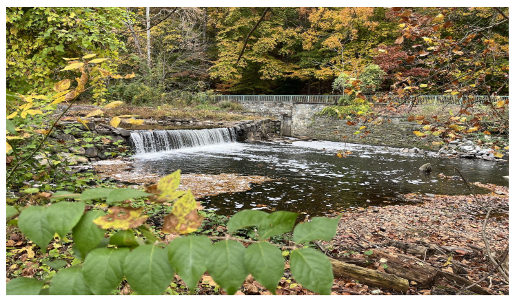
River in Peirce Mill

Create and develop an expandable, publicly available library of historical information for the identified sites and individuals