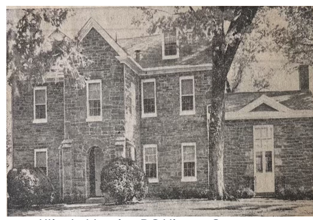
Klingle Mansion DC History Center