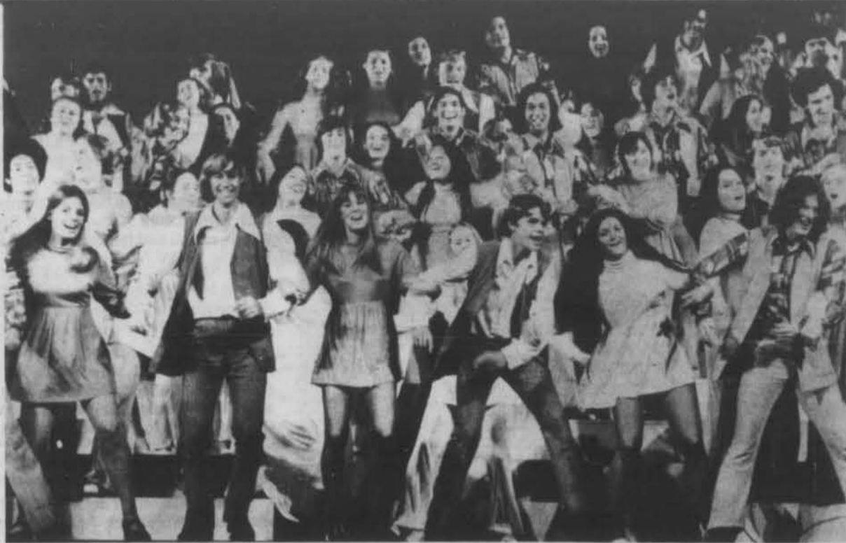
A cast of Up With People is swaying to a Flemish folk song while on a tour of Belgium.

Tickets are available at the WPI P.R. Office, Thom McAn, Chess King, State Mutual, Peoples Bank, Commerce Bank, and Guarantee Bank for only $2.50. For more information call 753-1411, ext. 305 or 306.