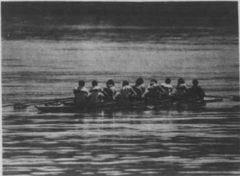
The Heavyweights power to the starting line and eventual victory in the City Championships.