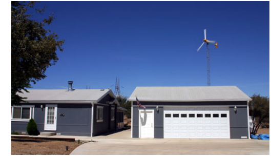
A 10kW wind turbine in OAK HILLS CA

www.wpi.edu/~bmcoughlin/powertheworld/windenergysolutions.html