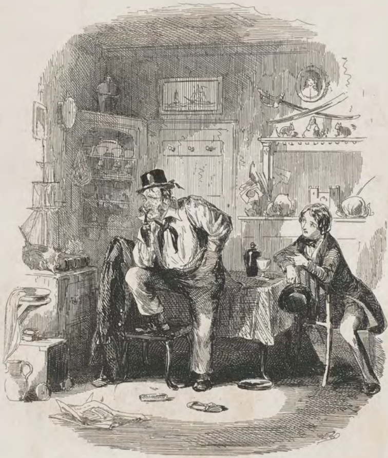
Profound cogitation of Captain Cattle.