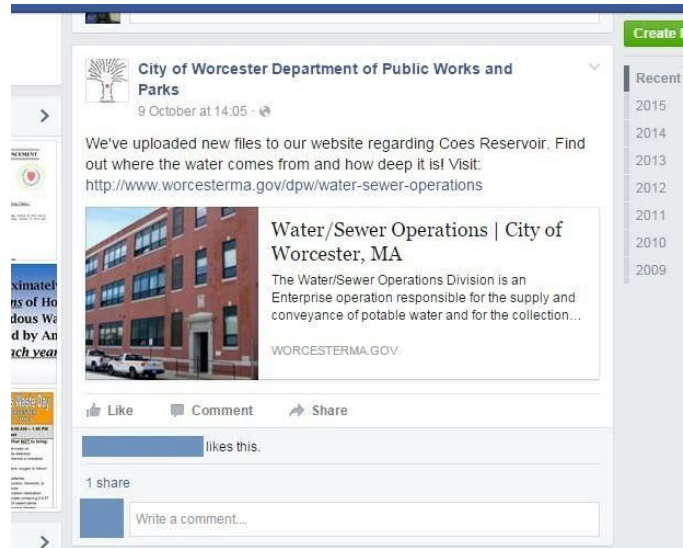
Fig. (3) A facebook post by the Department of Public Works and Parks in the City of Worcester, Massachusetts

Any person with internet access is able to follow state government social media pages. The Commonwealth of Massachusetts, for instance, has Twitter accounts for its offices, several of which use other social media platforms including Facebook, Youtube, LinkedIn, Instagram, and Flickr. These accounts allow the offices to share what actions are being taken in an environment that allows people to directly respond. The Twitter feed of the Governor of Massachusetts, Charlie Baker, made several posts in October, 2015 referencing an education law allowing the creation of several charter schools in Massachusetts. These posts outline what actions are being taken as well as why they are being taken. (Baker, 2015) These posts act as a bridge between the government and the people, allowing for closer and more frequent interactions between the two.