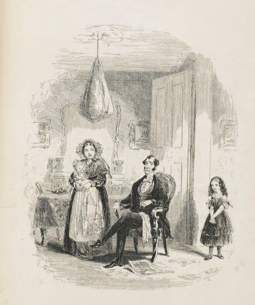
The Dombey Family.