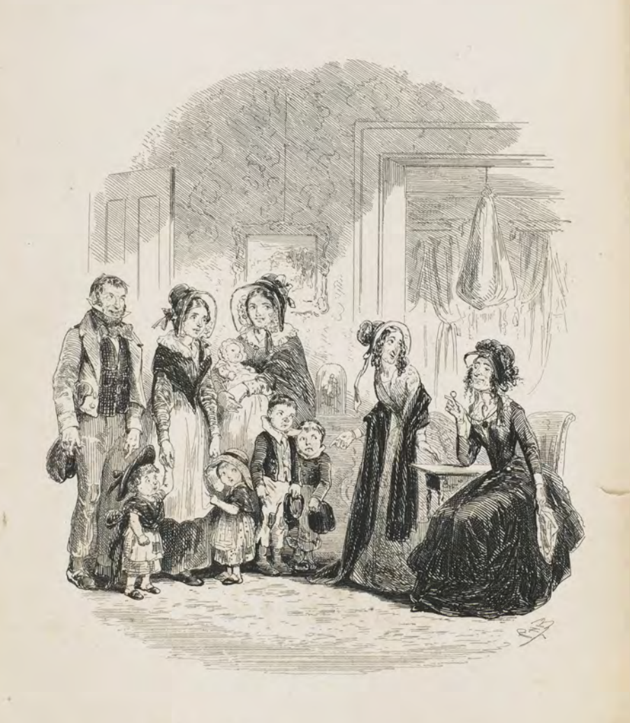
Mifs Tox introduces "the Party