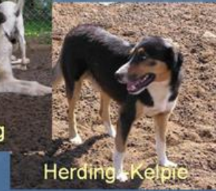
Herding – Kelpie