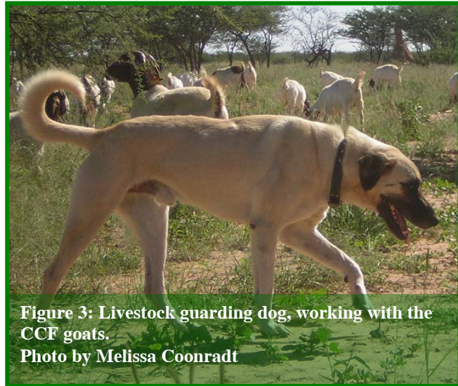
Figure 3: Livestock guarding dog, working with the CCF goats.

The Anatolian sheepdog originated in Turkey, where it was first used as a livestock guardian (New Zealand Kennel Club); it is estimated that the breed has been in existence for over 6,000 years (American Kennel Club). The dog's size and temperament make it