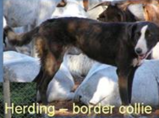
Herding – border collie