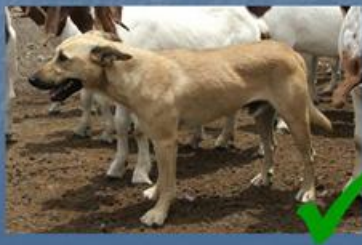
Strong and Stocky