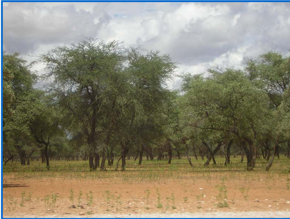
Figure 2: Communal farming areas are heavily overgrazed; no grass is able to grow in these areas, even during the rainy season.

commercial lands are used mainly for meat sales. Commercial livestock farms produce mostly cattle, although there is some farming of goats and sheep. The difference between commercial and communal farming areas is very evident, as there is little or no grass in the communal areas while commercial farms tend to have an abundance of grasses and other foliage for grazing (Figure 2).