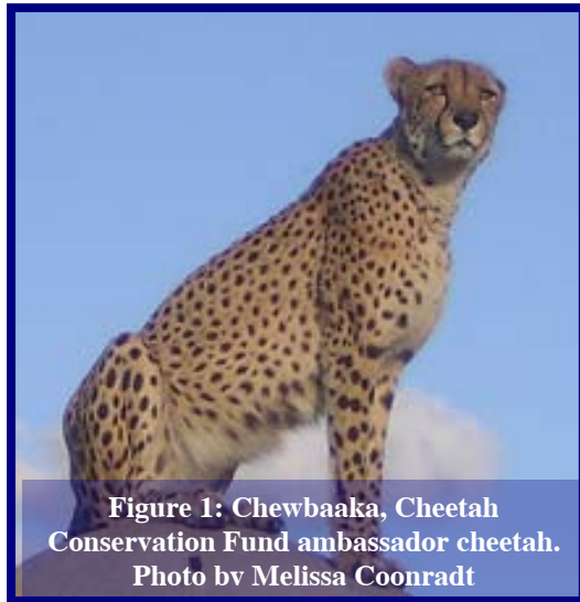
Figure 1: Chewbaaka, Cheetah Conservation Fund ambassador cheetah.

The cheetah ( Acinonyx jubatus ) (Figure 1) once ranged across the African continent from South Africa to the Mediterranean Sea, throughout Saudi Arabia to India and north to Turkmenistan (Nowell, 1996). In 1975, the population was estimated to be roughly 30,000, though a drastic fall in numbers continued through the 1980s until the