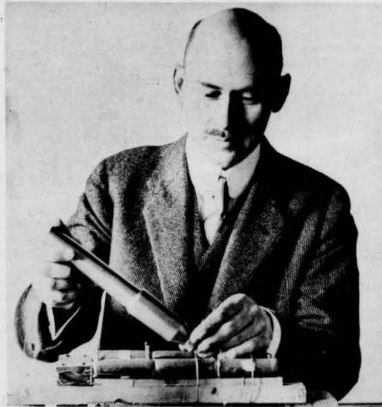
Bobby and Bomb

These societies are as old as the school. Founded independently of each other in 1865, these four societies grew in membership and prominence on "the Hill" until their presence was hard felt. The