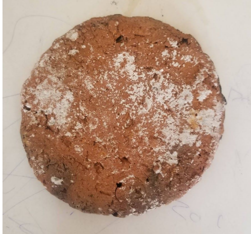
Figure 4: Clay-Sawdust Filter Made from 1:1 Ratio of Clay and Sawdust After Being Fired

Water was able to pass through this filter and even collect some sediment from the water. The other two ratios did not work out. The filter that was made with 20% clay and 80% sawdust was extremely difficult to mold and it fell apart soon after being submerged in water. The 40/60 filter could withstand a little more pressure as compared to the 20/80 filters, although it did not do better than the 50/50 filter. One of the greatest challenges that came with creating the clay-sawdust filter was the lack of a kiln. In order for clay to be fired properly, it needs to experience extreme heat for a long period of time. First, we attempted to locate a kiln. The nearest kiln was more than two hours away and would not be easily accessible to the local community of Kyebi. As a result, we attempted various firing methods. The firing method that was most successful was placing the clay-sawdust filters in an LPG oven for several hours. This testing was extremely preliminary, but it allows us to understand what processes can be used to create the filter.