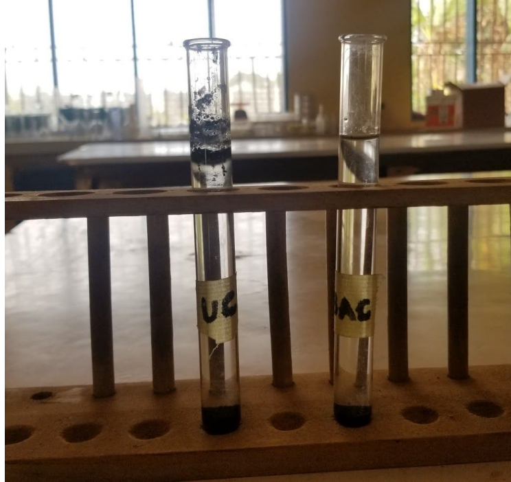
Figure 2: Images of test tubes containing UC on the left and B 1 BAC on the right on Day 5