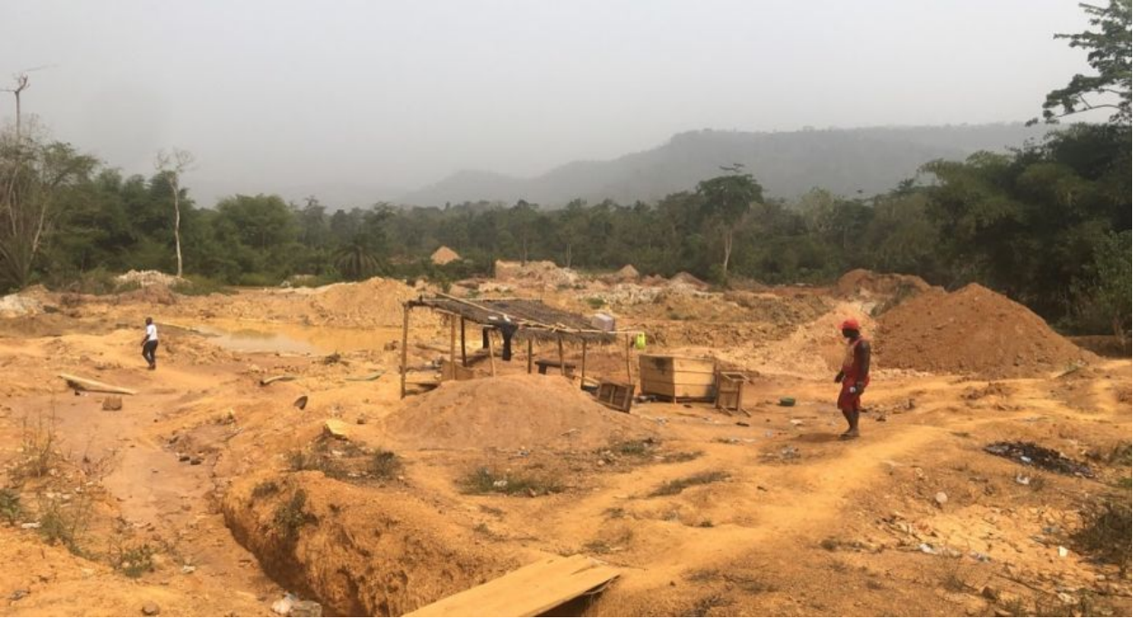
Figure 1: ASGM Site in Osino, Ghana

The process of ASM to recover gold from the mining site is as follows: