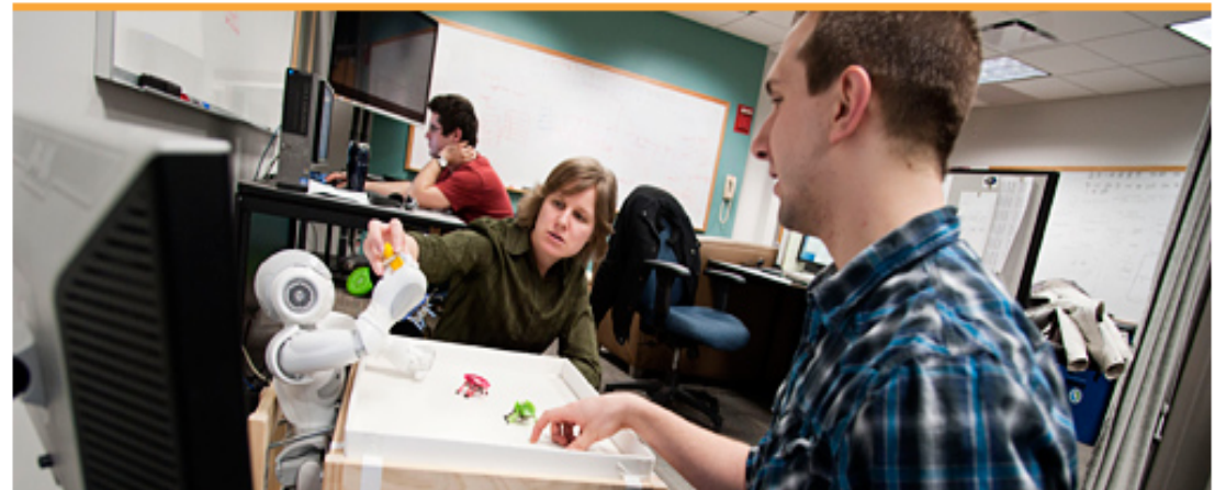
Major Qualifying Project