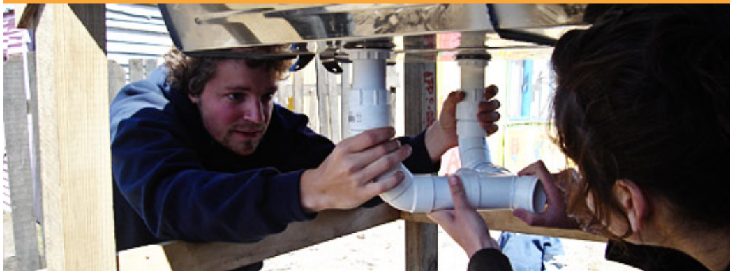
The Most Distinctive—and Personally Rewarding—Element of the WPI Plan