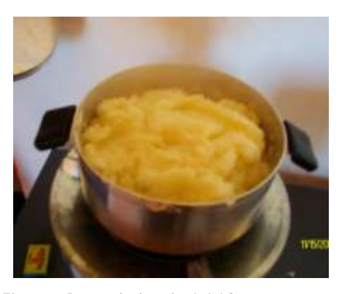
Figure 5: Pap cooked on the Arivi Stove

Table 1: Cooking Time for Typical Meals *based on a survey of 6 homes.