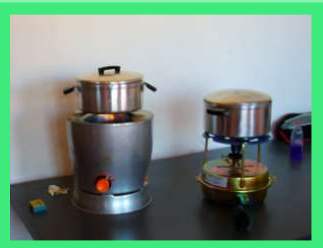
Figure 9: Arivi Safe Paraffin Stove (left), ParaSafe Primus (right)