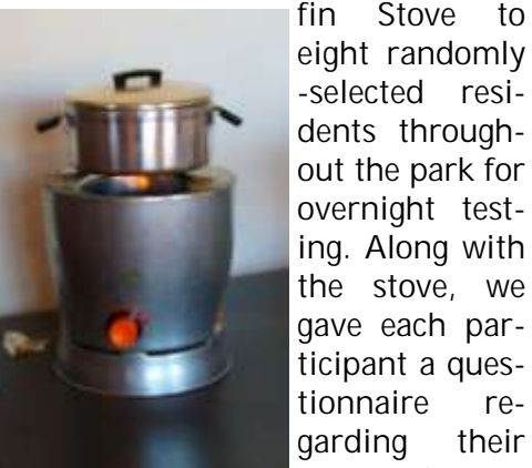
Figure 3: The Arivi Safe Paraffin Stove

Then we contacted various stove companies, specifically one called Arivi, which made safe flame stoves. Arivi sent us a prototype of one such stove to test and present to the residents of Monwabisi Park. We distributed the Arivi Safe Paraf-