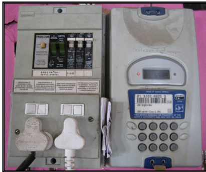
Figure 3: Eskom Electricity Dispenser

Formal connection to the electricity grid is obtained through an electricity dispenser, ED, which is directly connected to the nearest electricity supply pole. The box is delivered and installed by an Eskom (the local energy supplier) worker and costs R200. This is 13% of the average Monwabisi Park resident’s monthly income and is often a monetary burden on the family. Therefore people are also forced to purchase their electricity from a neighbor and informally connect to their ED. During windy and rainy times these informal connections