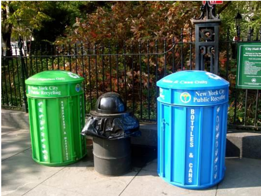
Figure 7: New York City’s dual stream recycling system in a public place (“Getting Expanded,” 2010)

recycling on Aug 14th, 2010 (“A Local Law,” n.d.). The program has been considered to represent an important part of the city's overall commitment to a greener, cleaner New York (“BWPRR Public Space Recycling,” n.d.). New York City public spaces that have adopted the program use citywide dual stream recycling: a green bin for paper and a blue bin for metal, glass, and plastic (MGP).