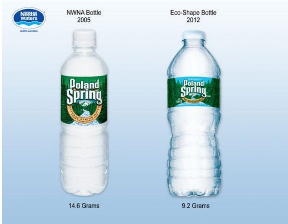
An example of reduction in product packaging

In order to ensure our suggestions would address all necessary aspects of an effective recycling program, we investigated the three pillars of recycling: access, incentive, and education. Access refers to how easy it is for residents to find convenient opportunities to recycle, as well as the quality of the opportunities themselves. Lack of access in public space, caused by a shortage of well-maintained receptacles, contributes to littering behavior (“A Review,” 2007). Maintenance of receptacles is also required for access to recycling opportunities, especially in public spaces (“Littering Behavior,” 2009). Proper access to recycling opportunities alone, however, does not guarantee an effective recycling program. Incentives encourage people to take advantage of the recycling opportunities that are provided. Education and awareness are also two important components affecting the consumers’ willingness to recycle. According to research on the factors influencing the recycling rate of Minnesota counties, it was examined that “communities with grant allocation for recycling education or equipment recycle significantly more than communities without any allocation” (Sidique, Joshi, and Lupi, 2009, p. 244). To ensure the efficiency of recycling programs, various states have utilized different educational methods including the dissemination of information, activities and events, and competition.