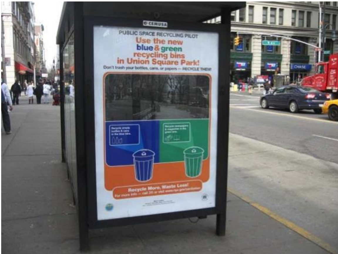
Figure 8: Poster used to reinforce DSNY’s blue and green color themes for source separated recycling in a bus shelter beside a public park (Lange, 2007)