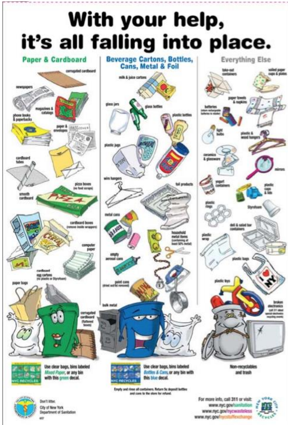
Figure 9: Poster illustrating how common solid waste should be separated (Lange, 2007)

BWPRR also formed an outreach team to hand out morning copies of the daily Metro wrapped in promotional flyers to commuters. The outreach team was responsible for hosting special events with their recycling mascots at ferry terminals and other