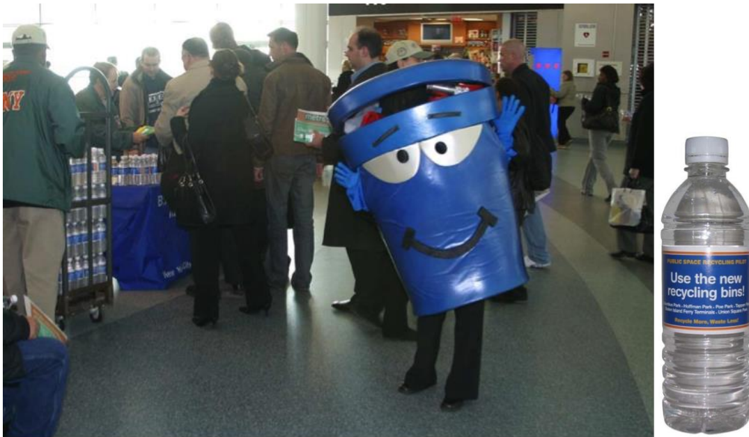
Figure 11: Recycling mascot and free giveaway during rush hour at Whitehall Ferry Terminal (Lange, 2007)

The 2007 report on NYC’s pilot program suggested several major findings that should be considered for a successful public space recycling program. A responsible department needs to consider the choice between single stream and multi-stream recycling with respect to labor, cost, and contamination. As the research reported, “public space recycling works well for paper, but not for bottles and cans” (Lange, 2007,