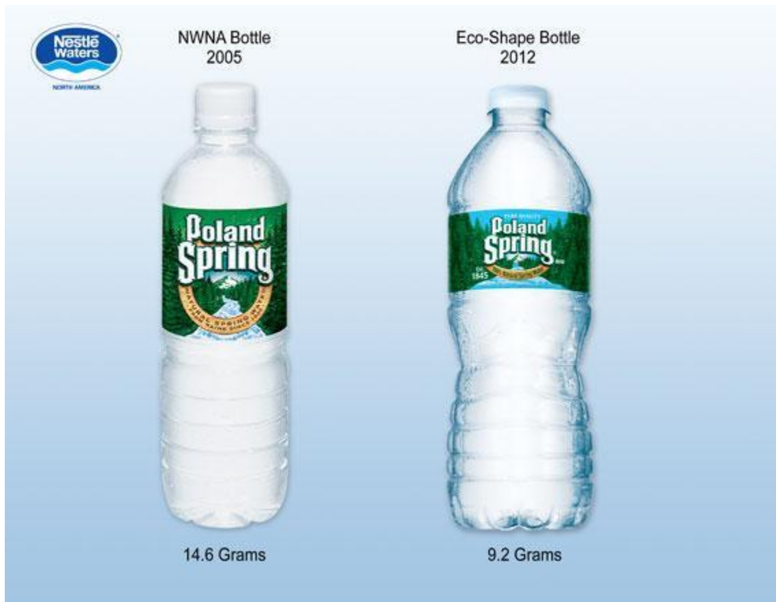
Figure 2: Source reduction in Poland Spring bottles (Stevenson, 2012)

Excess consumption of raw materials can be alleviated by reducing the amount of materials used in packaging, a practice known as source reduction. Packaging accounts for more than 30 percent of municipal waste, of which 40 percent is made of plastic (Rogers, 2005). As mentioned earlier, this packaging also accounts for a significant amount of litter in public spaces. Some companies have made progress in source reduction. Pictured below is a comparison of old and new Poland Spring bottles, the latter of which uses less plastic than the former with a difference of approximately 5.4 grams of plastic. The resulting bottle has a smaller cap and thinner sides (Stevenson, 2012).