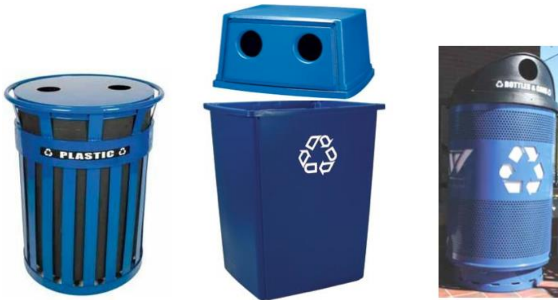
Figure 12: The three types of recycling bins used in Palm Beach County’s pilot program (“American Beverage,” n.d.)

The SWA promotes the pilot program in a number of ways. A “kick-off” event was held on America Recycles Day in 2012 to raise awareness about the new bins. Fliers and posters were distributed and displayed throughout the county. SWA also advertised the use of the bins using a booth constructed for the county fair (“Palm Beach County,” n.d.).