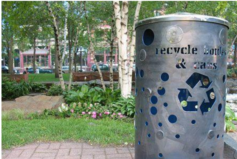
Figure 4: Recycling bin in Mears Park (“Creating art,” 2009)

Eureka Recycling reported that parallel access to recycling and trash receptacles does increase the recycling rate when compared to separated bins. The urban park pavilions reported an increase from 30% to 85% using parallel access (“Development of Best Practices,” 2013).