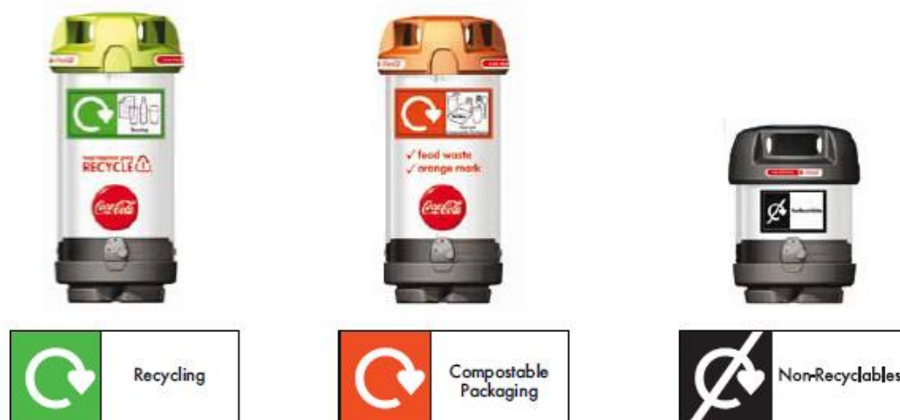
Figure 15: A Recycling bin, a composting bin and a trash bin used at the London Olympics (“Zero Waste Game,” n.d.)

Massachusetts may also consider requiring producers to put recycling or disposal labels on their product packaging. Vermont has developed universal symbols for trash, recycling, and food scraps, which are used on their recycling bins. If these same symbols were to be printed on packaging, they could serve as straightforward instructions on what should be recycled and how, as well as remind the consumer to recycle. If the labels were printed on both product packaging and recycling bins, the consumer can simply dispose of their waste in the matching bins. Figures 15 and 16 show how symbols on London’s food packaging matches the recycling bins used during the London 2012 Summer Olympics (“Zero Waste Game,” n.d.).