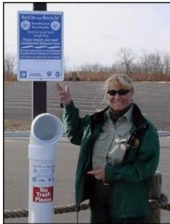
Figure 6: Collection bins made of PVC designed to collect fishing lines for recycling (“Monofilament Fishing Line Recycling,” n.d.)

In 2010, this program had assembled a cumulative total of 30 collection bins and signs in various Marina locations and state parks throughout the state for collecting monofilament fishing lines (see figure 6 below). The contents are shipped to Berkeley Conservation to be recycled. Educational signs and stickers were created for the collection bins. An assessment of the program reported that aluminum cans, cigarette butts, and bait were also found in the bins (“New Jersey Coastal Management Program,” 2010).