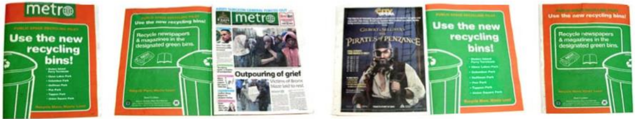
Figure 10: Flyers given out through the St. George Ferry terminal on April 2nd, 2007 (Lange, 2007)

transportation terminals during rush hour. For example, the outreach team handed out free bottled water with labels that encouraged using the new recycling bins during the first week of the Pilot (figures 10 and 11, below).