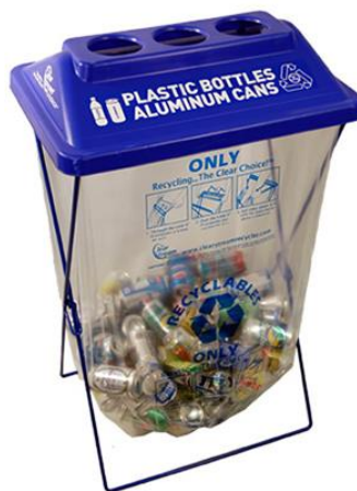
Figure 5: A Clear Stream container (“Event Recycling,” n.d.)

The Atlantic County Utility Authority promotes event recycling by loaning “Clear Stream” containers at no cost. Clear Stream containers are convenient to assemble, use and transport. These containers consist of a clear bag held up by metal crossbars and a lid designed to only receive plastic bottles and aluminum cans (see Figure 5). The borrowers of the containers are required to provide information to ensure the return of the containers. The event recycling program is advertised through Atlantic County Utilities Authority website where forms are available to request containers.