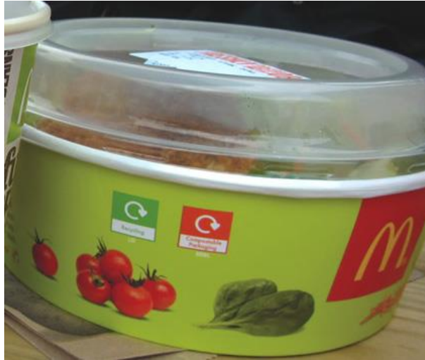
Figure 16: Color-coded recycling and composting symbols on food packaging in London (Sullivan, 2012)