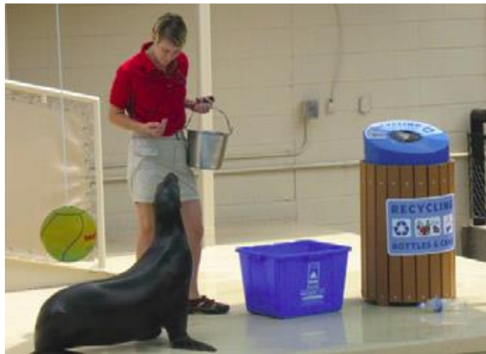
Figure 3: Photograph of a show used to educate guests of the Como Zoo on the zoo’s recycling program (“Development of Best Practices,” 2013)

At the Como zoo, new trash bins were also purchased and installed next to the new recycling bins. In total, 13 sets of containers are set up and the cost was $10,250 (“Development of Best Practices,” 2013). Information on how and where to recycle is posted on the website and displayed in the lobby. Additionally, a show involving a sea lion and trainer is used to advertise how easy it is to recycle and how recycling can help reduce pollution (see Figure 3). The Como Zoo saw an increase in capture rate from 62% to 72% (“Development of Best Practices,” 2013).