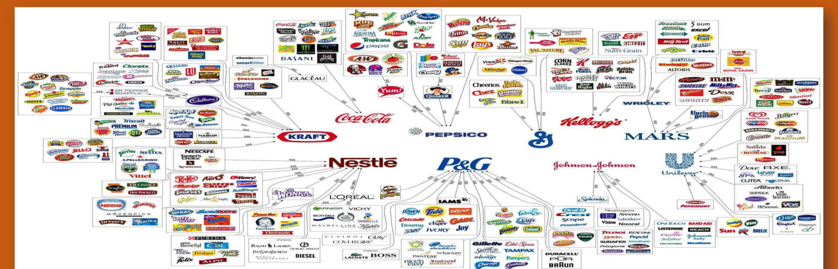
Global Companies with Palm Oil in their Products