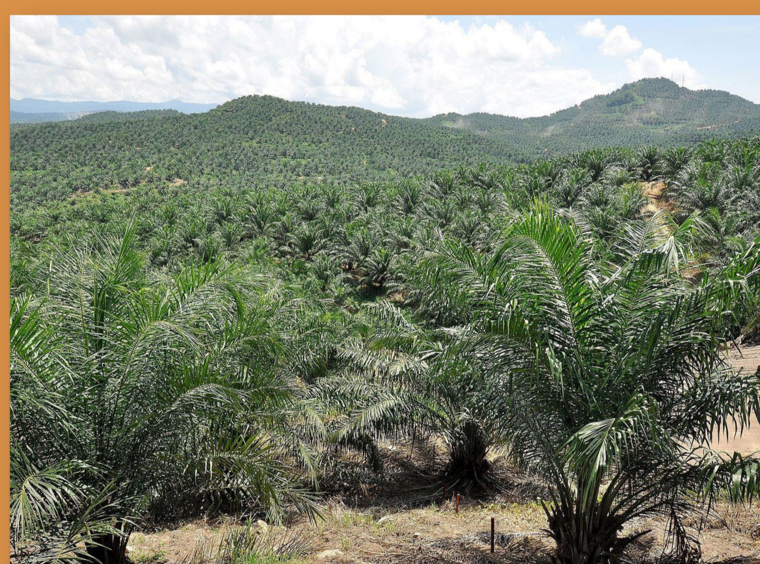
Monoculture of Oil Palm Trees

Top Right: Red shows forest lost to deforestation in Borneo Bottom Right: Map of logging and plantations in Borneo in 2010