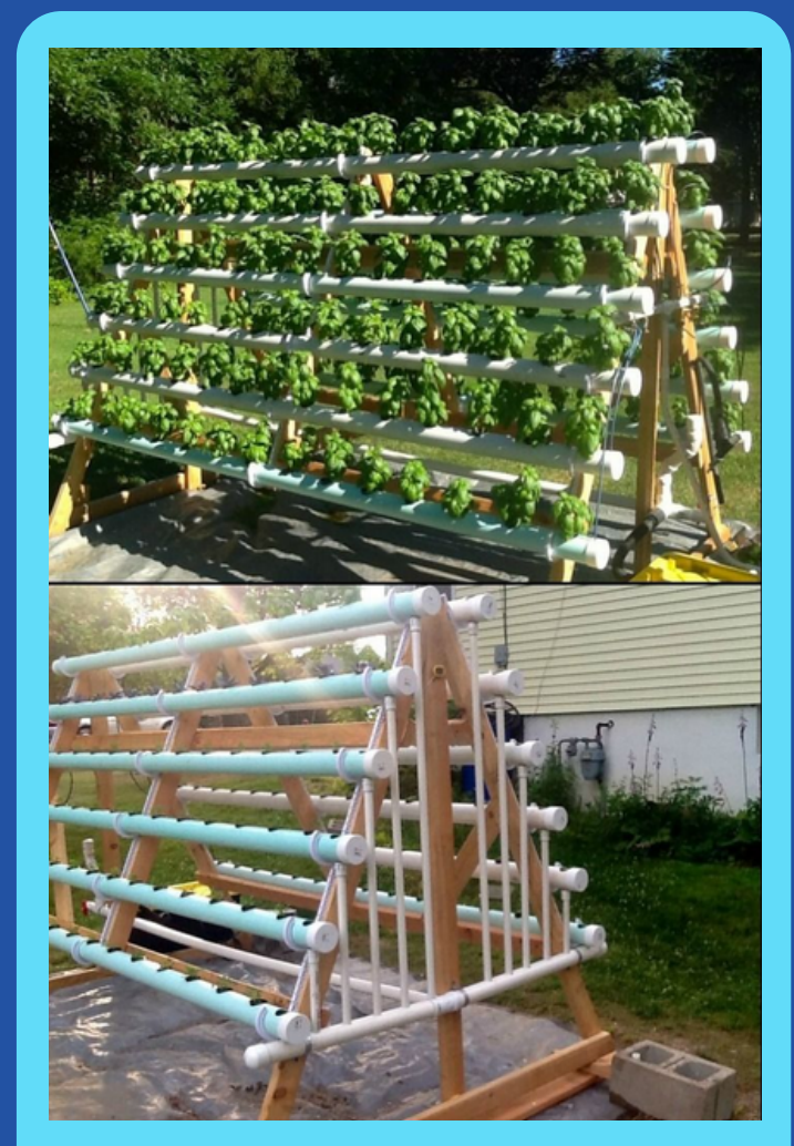
Figure 1: A-Frame NFT Hydroponic System

A major benefit of hydroponic systems come from its water efficiency compared to traditional methods for growing crops, making it especially useful for agriculture in arid regions. Several countries around the world have been using hydroponics as a way to get around low rainfall and natural water reserves, with countries in the Middle East setting up hydroponic complexes combined with desalination units to meet local needs for food and water (Stauffer, 2006). This water efficiency comes from the fact that most of the water remains in the system and is recycled. Namibia is another country greatly impacted by limited water resources. In 2019, Namibia entered a Drought State of Emergency where nearly 556,000 individuals are expected to be impacted by a lack of water (UNICEF, 2019). Hydroponics systems provide an additional method of agriculture that is not as dependent on water inputs and can increase production. Sustainable systems such as this have the potential to greatly improve food security within the country as access to water becomes more challenging.