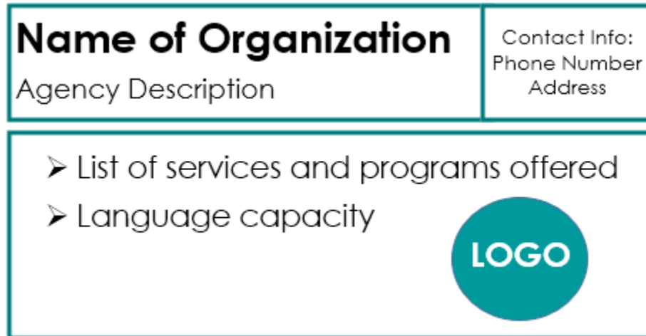
Figure 3: Format example for each organization in the Resource Guide

The procedure on how to update the Resource Guide includes the following: