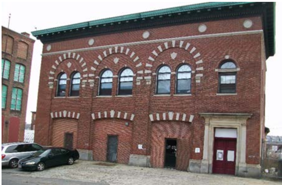
Figure 1: The Shalom Neighborhood Center in Worcester, MA

The Shalom Neighborhood Center (SNC) is a community-based organization for the diverse ethnic population of Worcester (see figure 1).