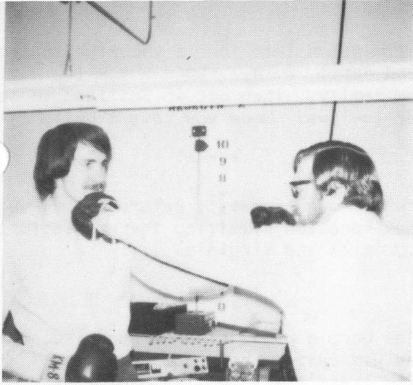
Plant II Production and Q.A. settle their differences!!!